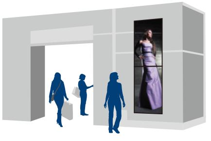
Product details and textures are clearly shown. The 4K display is ideal for capturing attention.